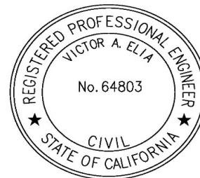
Civil Engineer's Stamp

*Flood Control Construction Cost Estimate to be provided by Flood Control District. Provide a copy of Flood Control District letter stating cost estimate.