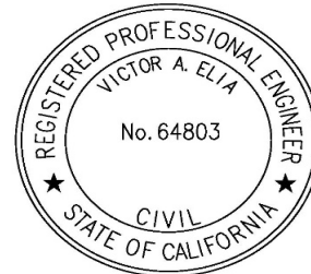
Civil Engineer's Stamp

*Flood Control Construction Cost Estimate to be provided by Flood Control District. Provide a copy of Flood Control District letter stating cost estimate.