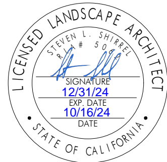
Landscape Architect's Stamp

*Flood Control Construction Cost Estimate to be provided by Flood Control District. Provide a copy of Flood Control District letter stating cost estimate.