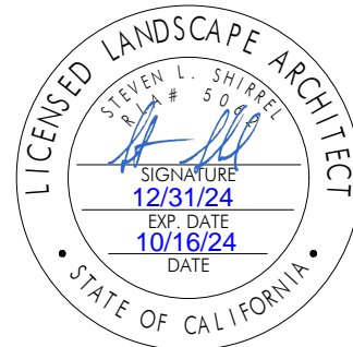
Landscape Architect's Stamp

*Flood Control Construction Cost Estimate to be provided by Flood Control District. Provide a copy of Flood Control District letter stating cost estimate.