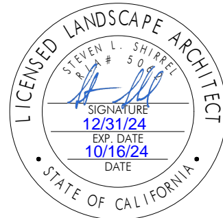
Landscape Architect's Stamp

*Flood Control Construction Cost Estimate to be provided by Flood Control District. Provide a copy of Flood Control District letter stating cost estimate.