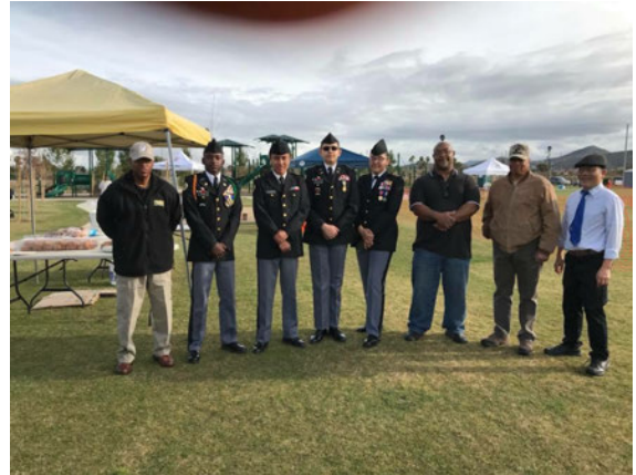
Mayfield Park Grand Opening with JROTC