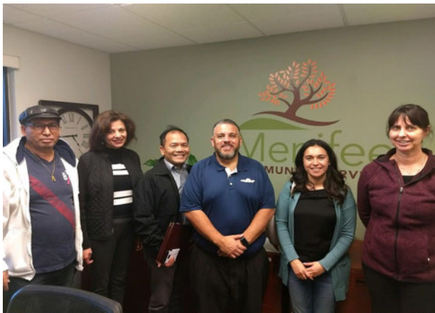
Cottonwood HOA group meeting with Menifee Community Service