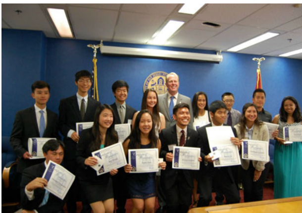
Students Awards by San Diego Mayor