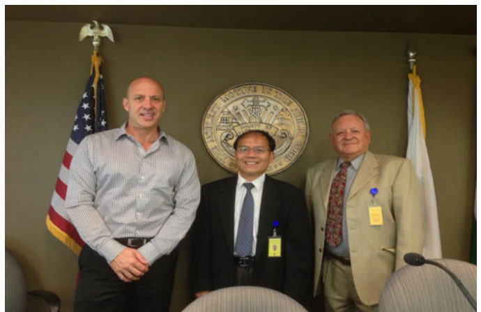
Board members, San Diego Property Tax Appeals Board