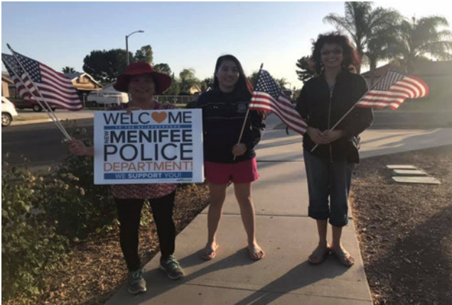
Menifee Police Caravan Parade