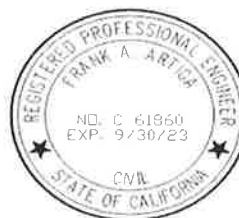
Civil Engineer's Stamp

*Flood Control Construction Cost Estimate to be provided by Flood Control District. Provide a copy of Flood Control District letter stating cost estimate.