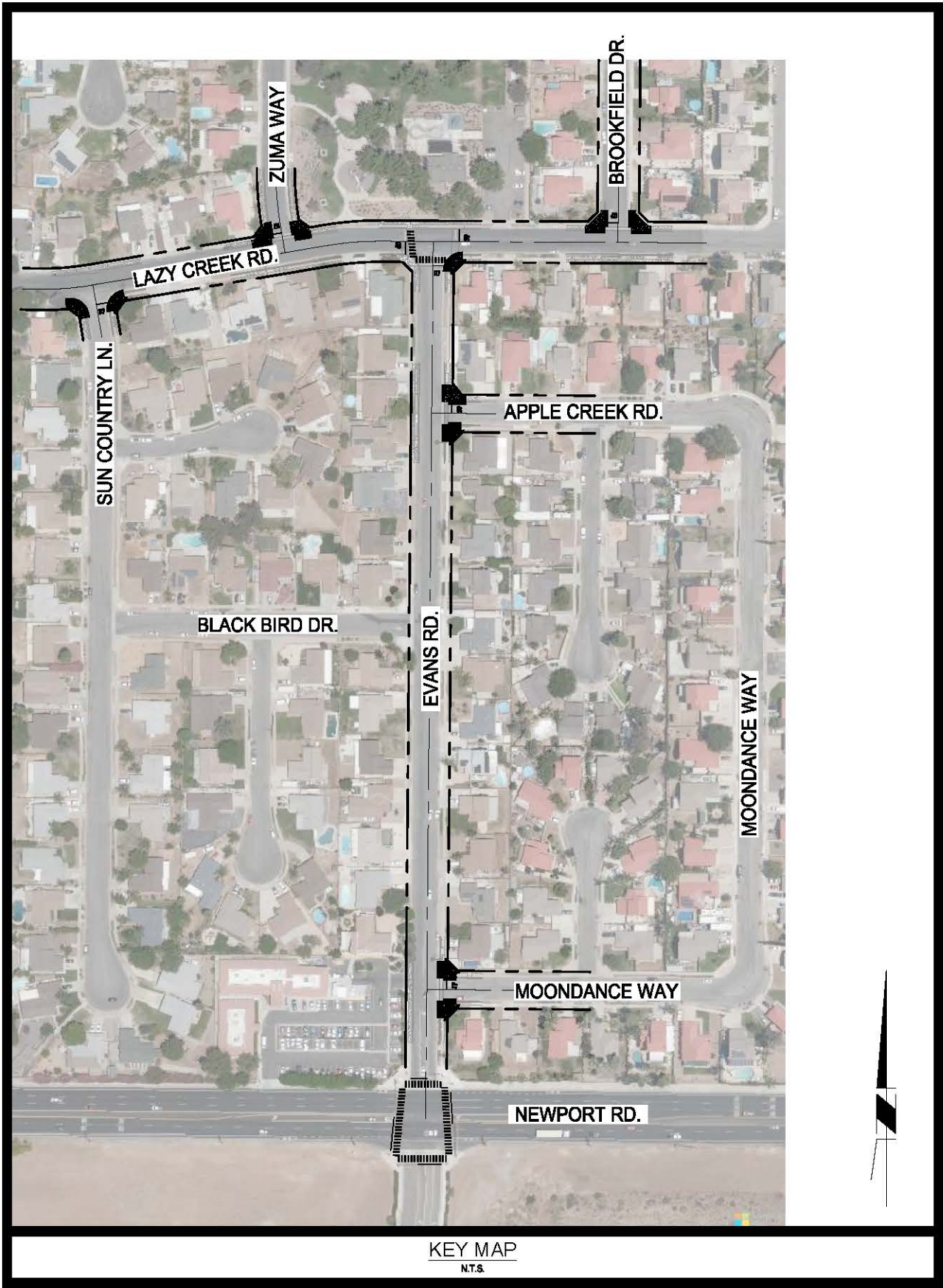
KEY MAP N.T.S.