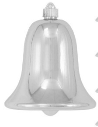
(125) Silver Bell Shatterproof Ornaments