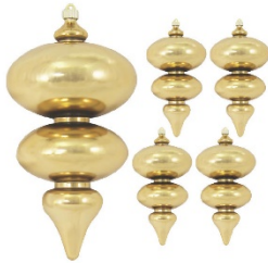
(125) Gold Finial Shatterproof Ornaments