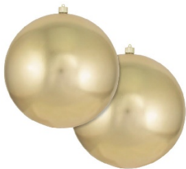
(125) Gold Shatterproof Ornaments