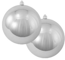
(125) Silver Shatterproof Ornaments