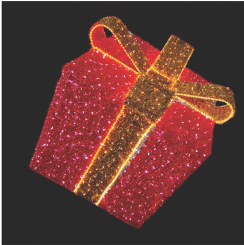
6 Foot LED Gift Box