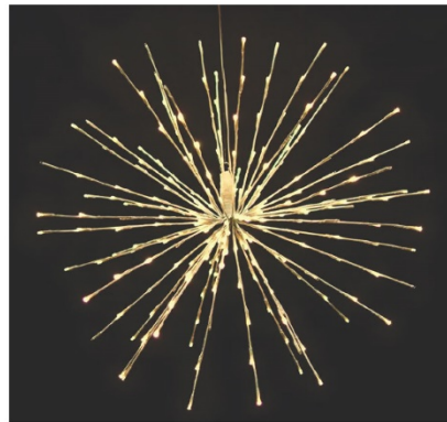
(36) Warm White LED Twinkling Spritzer