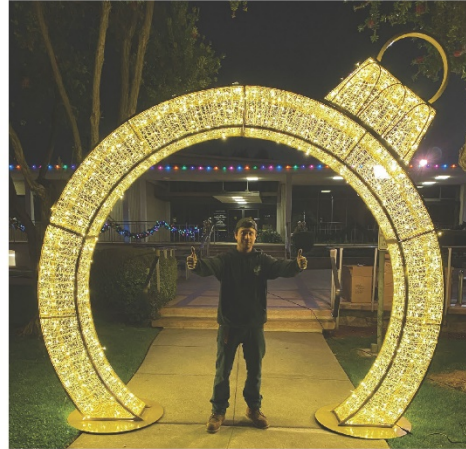
Walk Thru Element: 11FT Walk Thru Ornament Ring with Custom Gift Tag