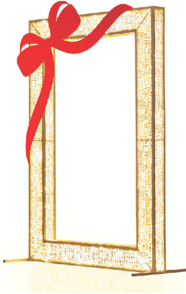
8FT Warm White LED Selfie Frame