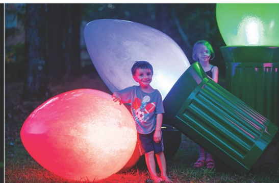
Unique Element: Lifesize LED RGB Bulbs (set of 5)