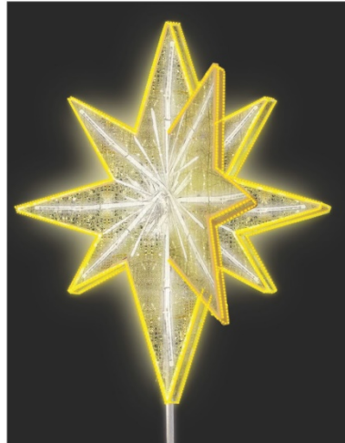
(1) 4FT Animated Star Topper