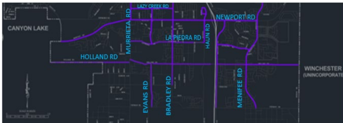
South portion of the City